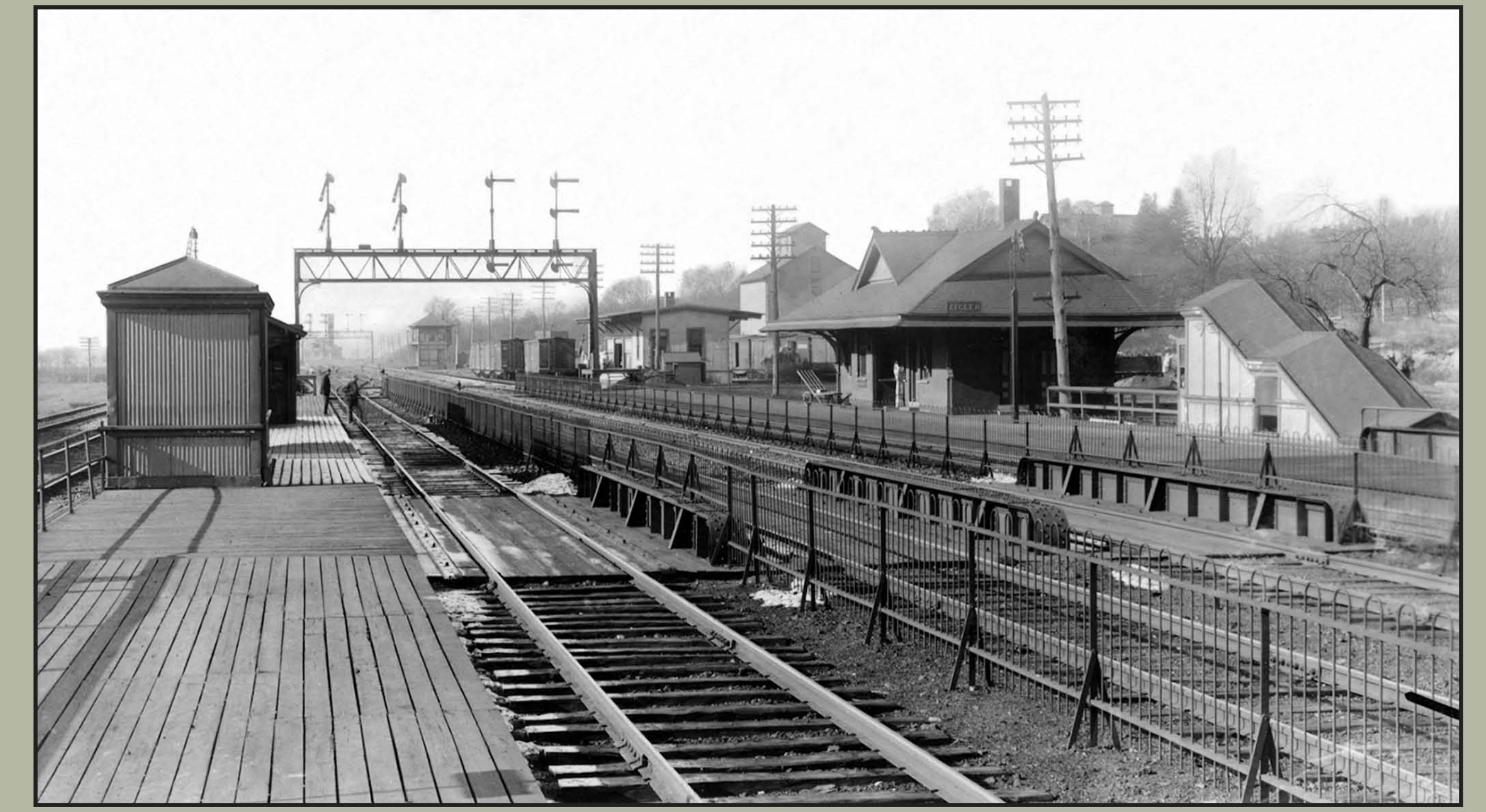
Chester County Historical Society, West Chester, PA.